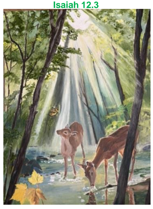
The Incorporated Synod of the Diocese of Algoma