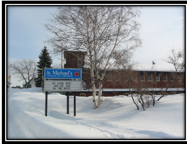
St. Michael's in winter