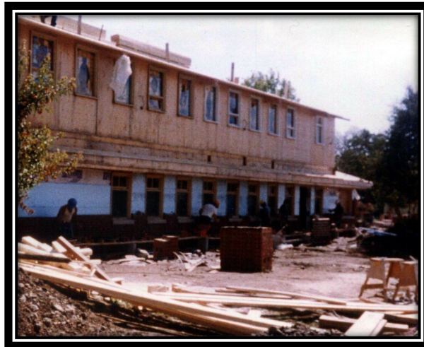
Addition under construction in 1989

Construction of a large addition on the west side of the building began in June 1989.