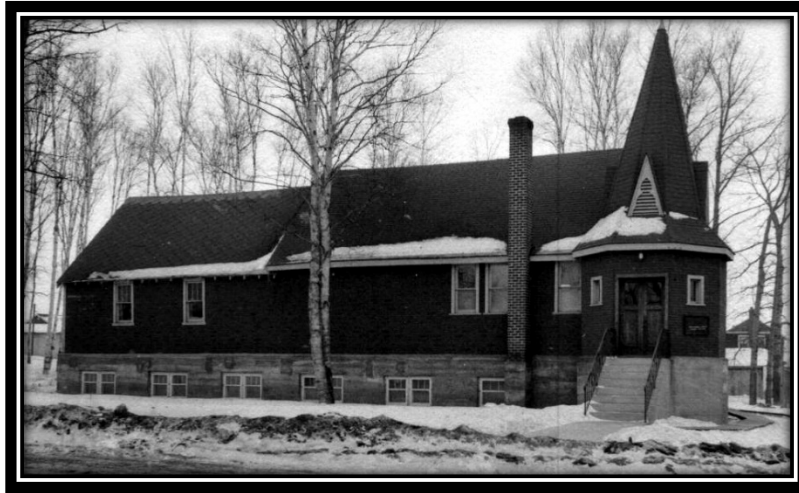
St. Michael's about 1950