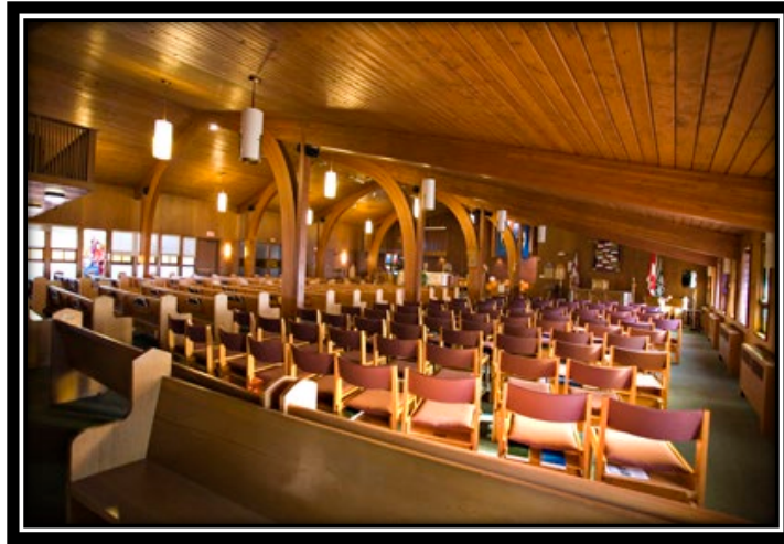
Non-fixed seating in the addition

A Men's Fellowship Group was started in 1991, meeting for breakfast on the last Saturday of the month. A Tuesday Morning Home Study Group was formed in 1993 and continues to meet biweekly for study and discussion. In October 1994 work started on St. Michael's Memorial Garden and the first scattering of ashes took place in November of that year.