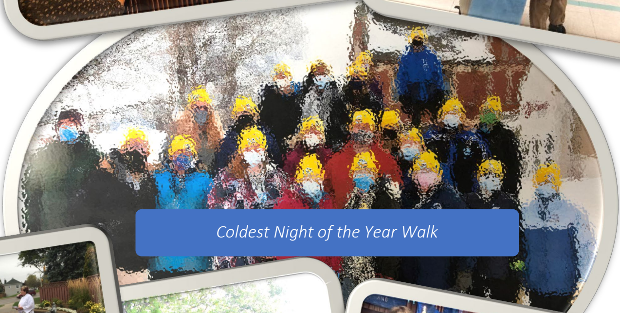
Coldest Night of the Year Walk