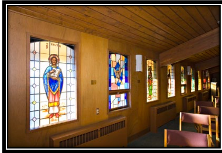
Stained glass windows on the west wall

Construction of a large addition on the west side of the building began in June 1989.