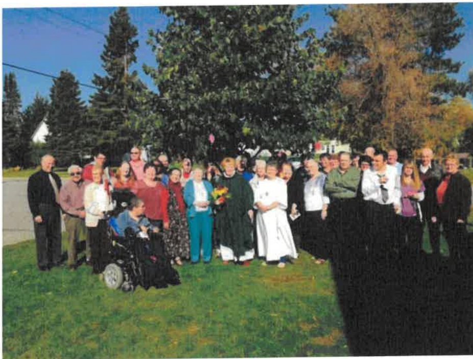
On this day, St. Mary's people wrote things they were thankful for on coloured paper leaves and hung them on the tree in the front yard of the church.

Nipigon/Red Rock functions as a secondary regional centre. Our communities have Public Schools, Separate schools, a high school, daycares, libraries, a fully staffed hospital and adjoining clinic, ambulance services, drug store, dentist, bank, credit union, grocery stores, general stores, hair dressers, restaurants, garages, insurance/investment company, LCBO, Beer store, Home Hardware, Funeral Home and Canadian Tire, museums, florist, motels, B&B, fire departments, tour guides, , local newspaper, computer technician. There is a handi-transit van for transportation to the City of Thunder Bay (100 km) where there is access to a larger regional hospital, specialists, eye care, therapists, etc. There are seniors apartments in Red Rock, Nipigon and Lake Helen, as well as local Senior clubs, Rotary club, Legions, Elks, Masons, TOPS (Take Off Weight Sensibly), and Minor Hockey teams.