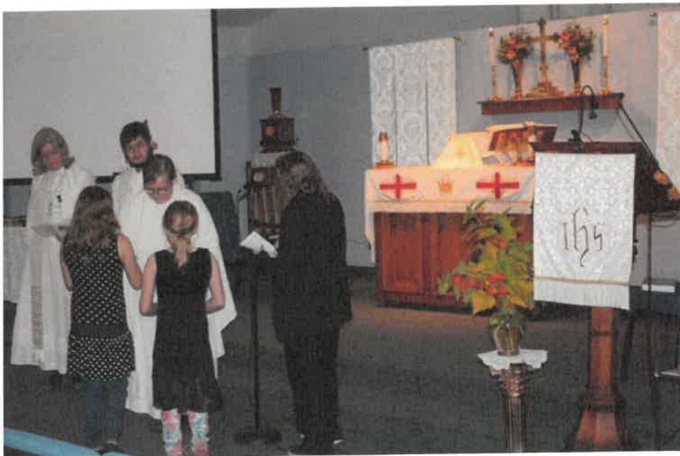
Celebration of new ministry

St. Mary's clergy have held Bible studies during Advent and Lent. These have been attended, lately on Zoom, by up to 10 people. There is potential for expanding these numbers when the pandemic is over. Not only do these learning opportunities increase Biblical knowledge in the congregation, but they add to a sense of closeness and understanding amongst participants who work together as a team to keep St. Mary's