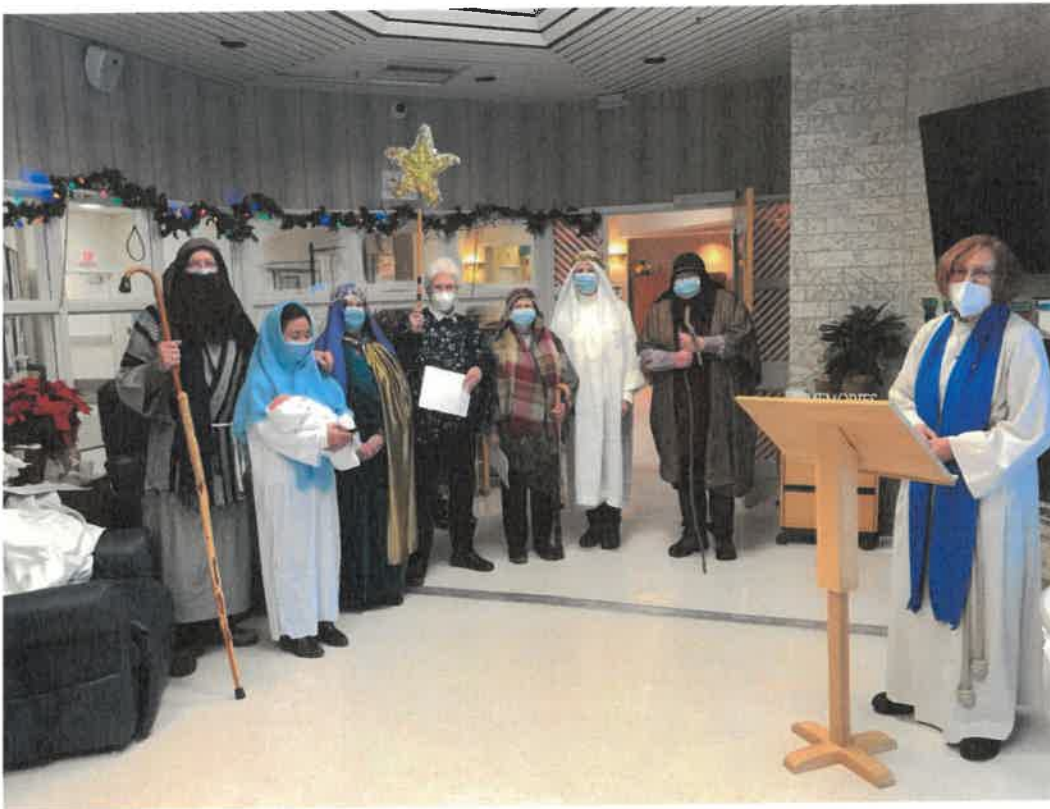
St. Mary's people in Bethlehem costumes, socially distanced from LTC residents, provided a Christmas service, December 2021.

St. Mary's clergy have always provided pastoral care to our parishioners and to members of the community not affiliated with our church. Taking turns with other churches, we have been active in providing worship services for the Long Term Care residents at the local hospital. Individual St. Mary's parishioners have volunteered to provide companionship and activities for residents. This care for the LTC residents has continued under lay leadership until the recent COVID shutdown.