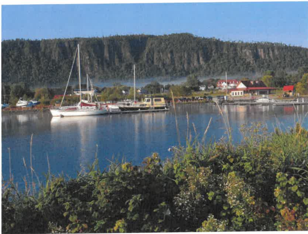
Red Rock Waterfront

Nipigon and Red Rock are located on the beautiful Nipigon River, close to where the river flows into Lake Superior, the largest freshwater lake in the world. We are minutes from wilderness and wildlife. Each community has a developed marina, with campsites at the Nipigon Marina and a park in Red Rock where a large Folk Festival was held for years before COVID. A multi-million dollar Parks Canada development is planned for the Nipigon Marina area, to be the headquarters for the National Marine Conservation Areas (NMCA) and the Lake Superior NMCA Discovery Centre.