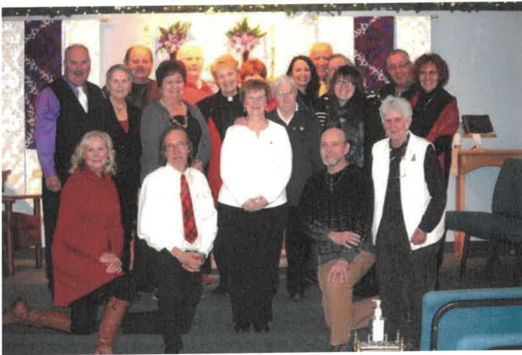
Group from different churches after an ecumenical event